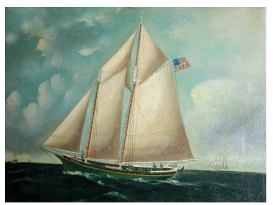
Schooner E. O. Gladys